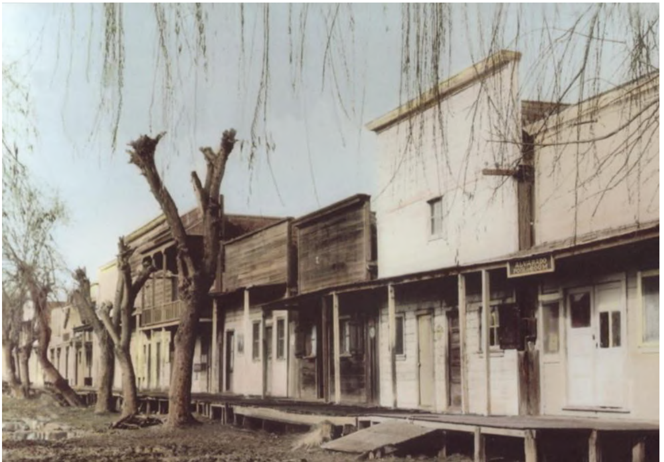
Alvarado's Chinatown just after the turn of the 20th Century. Note that Smith Street is not paved yet. Also note the board walk used during the rainy season and when the annual floods would come. These board walks were common throughout Alvarado.

But before it was known as "Little Tijuana" it was known as Chinatown. In the 1860 Alvarado census there were no Chinese reported to be living in Alvarado. The 1870 Alvarado Census showed that there were 107 Chinese living in Alvarado. Although this seems like a large leap, most towns in the Bay Area saw an influx of Chinese in the 1860's with the gold fields no longer panning out and the completion of the Transcontinental Railway in May of 1869. To be sure, Alvarado's Chinatown was no where near what San Francisco's became.